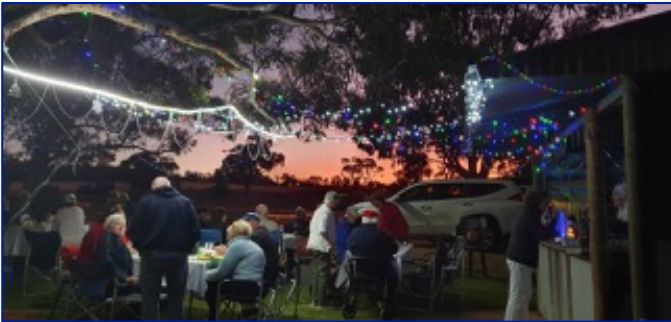
Beautiful sunset for our Bush Christmas Dinner