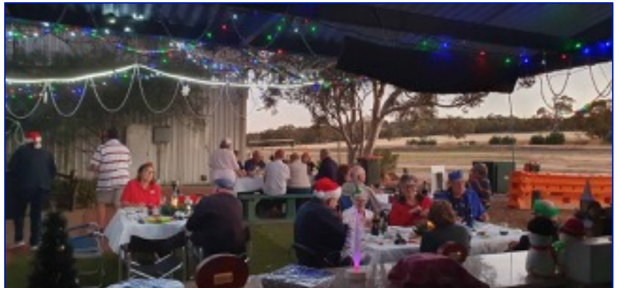
Bush Christmas under the fairy lights