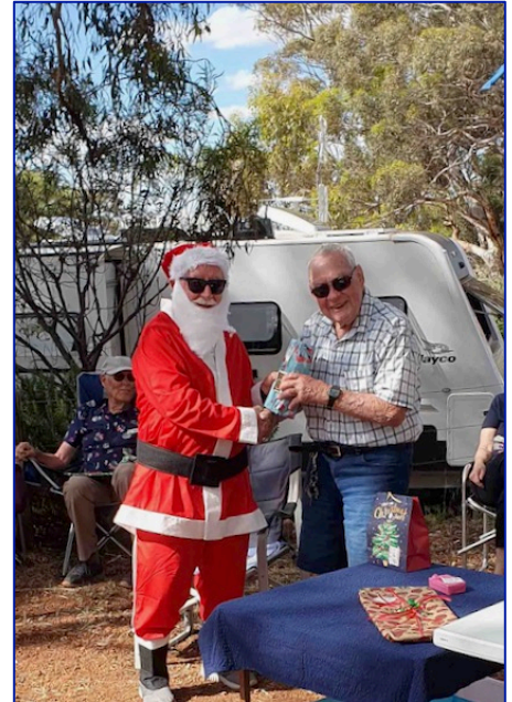
Some of the 'good' children receiving presents from Santa.

Our November Christmas Rally to Whitegum Farm was another fun filled event celebrated over four days in typical Sandgroper style. Read all about it in this bumper issue;