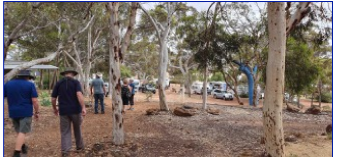
Walkers among the gumtrees at Whitegum Farm