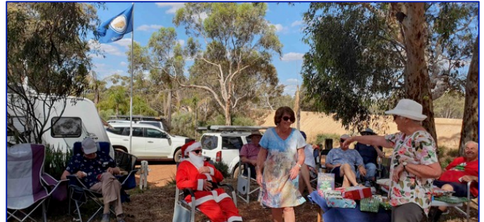
A very relaxed Santa visited us on Saturday and we all received presents even some of the naughty ones.