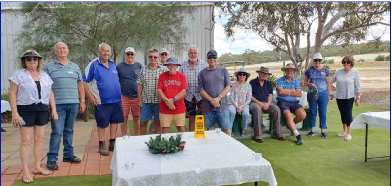
Many hands make light work! Thank you to all the volunteers who helped set up for the Bush Christmas night.