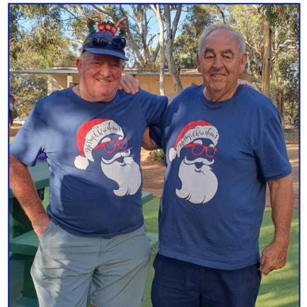
and more twins!