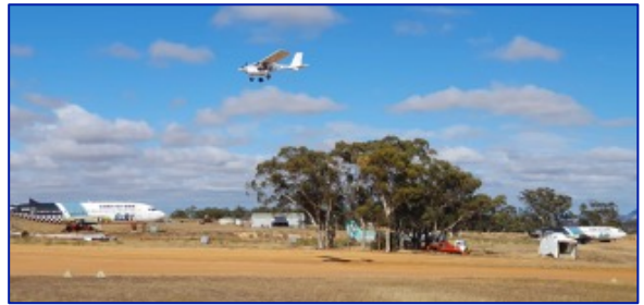
Plane taking off alongside the caravan park